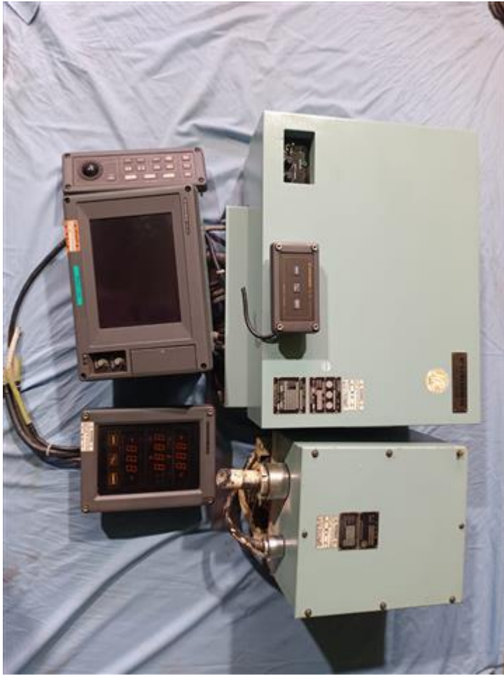
EQUIPMENT LIST DATED 03.05.2025